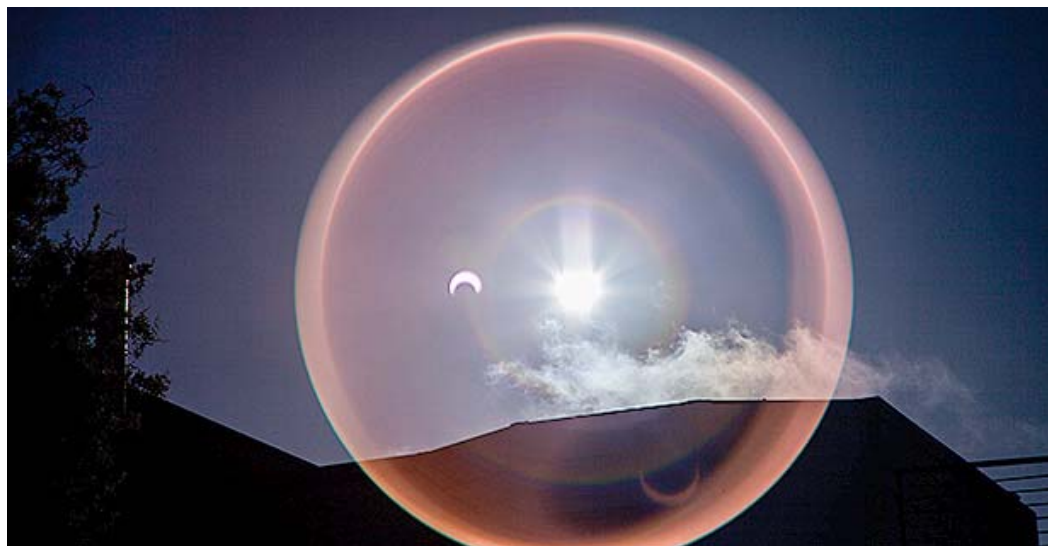
How much of California's solar will go offline during today's eclipse?

Today's full solar eclipse will mesmerize the entire U.S., but for power nerds, eyes are trained on sun-thirsty California.