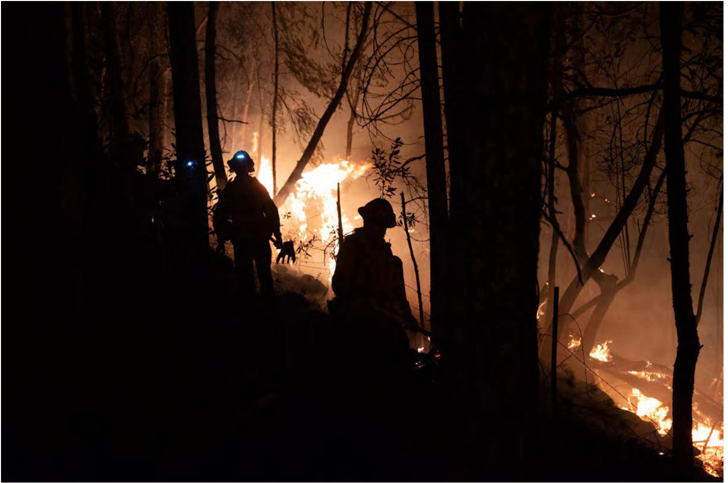
Firefighters monitor a backburn outside Calistoga, CA Thursday, Oct 1, 2020.