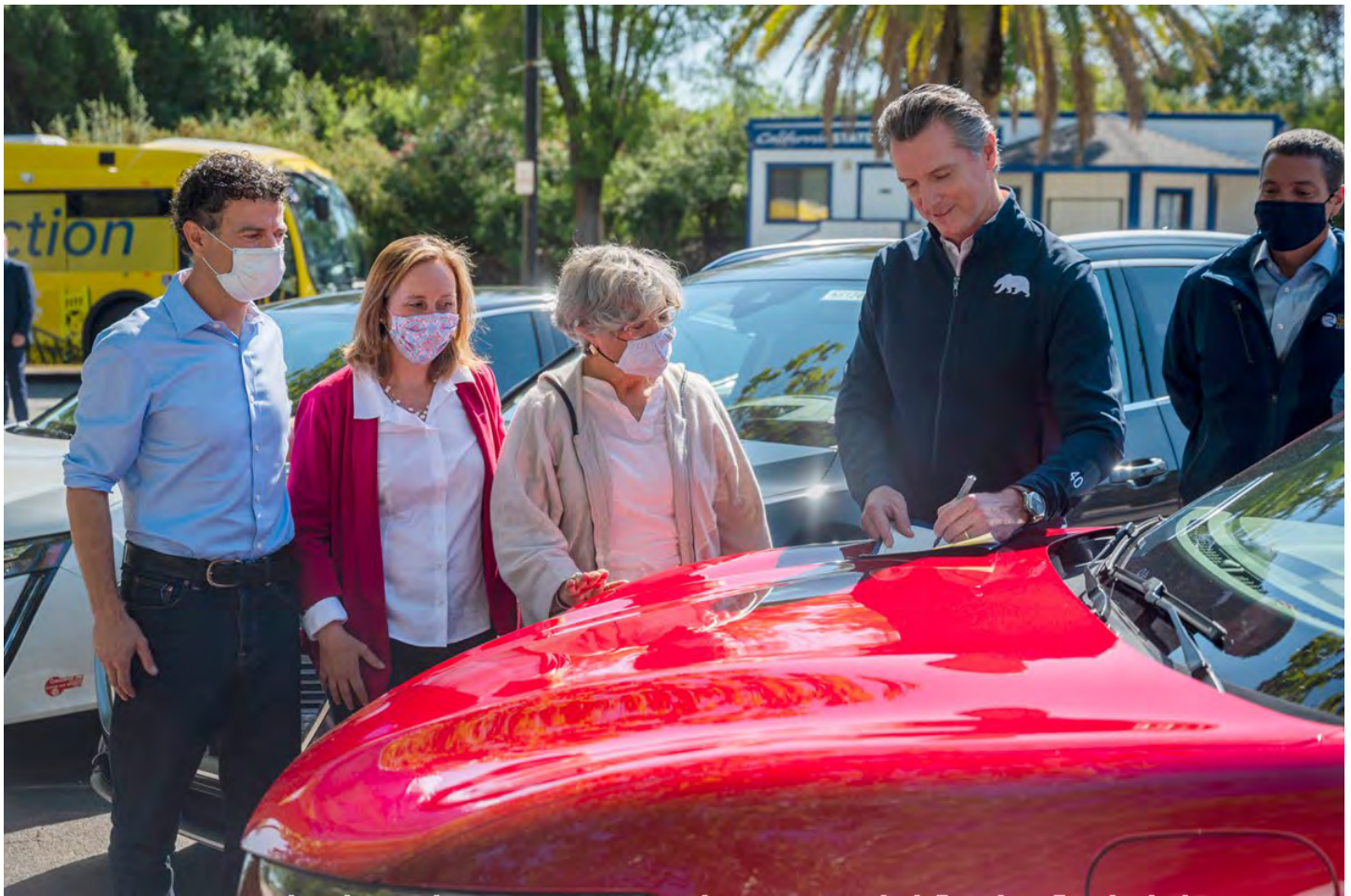
On the hood of an electric car, California Gov. Gavin Newsom signs an executive order requiring all new passenger vehicles sold in the state to be zero-emission by 2035 after a press conference on Wednesday, Sept. 23, 2020, at Cal Expo in Sacramento.