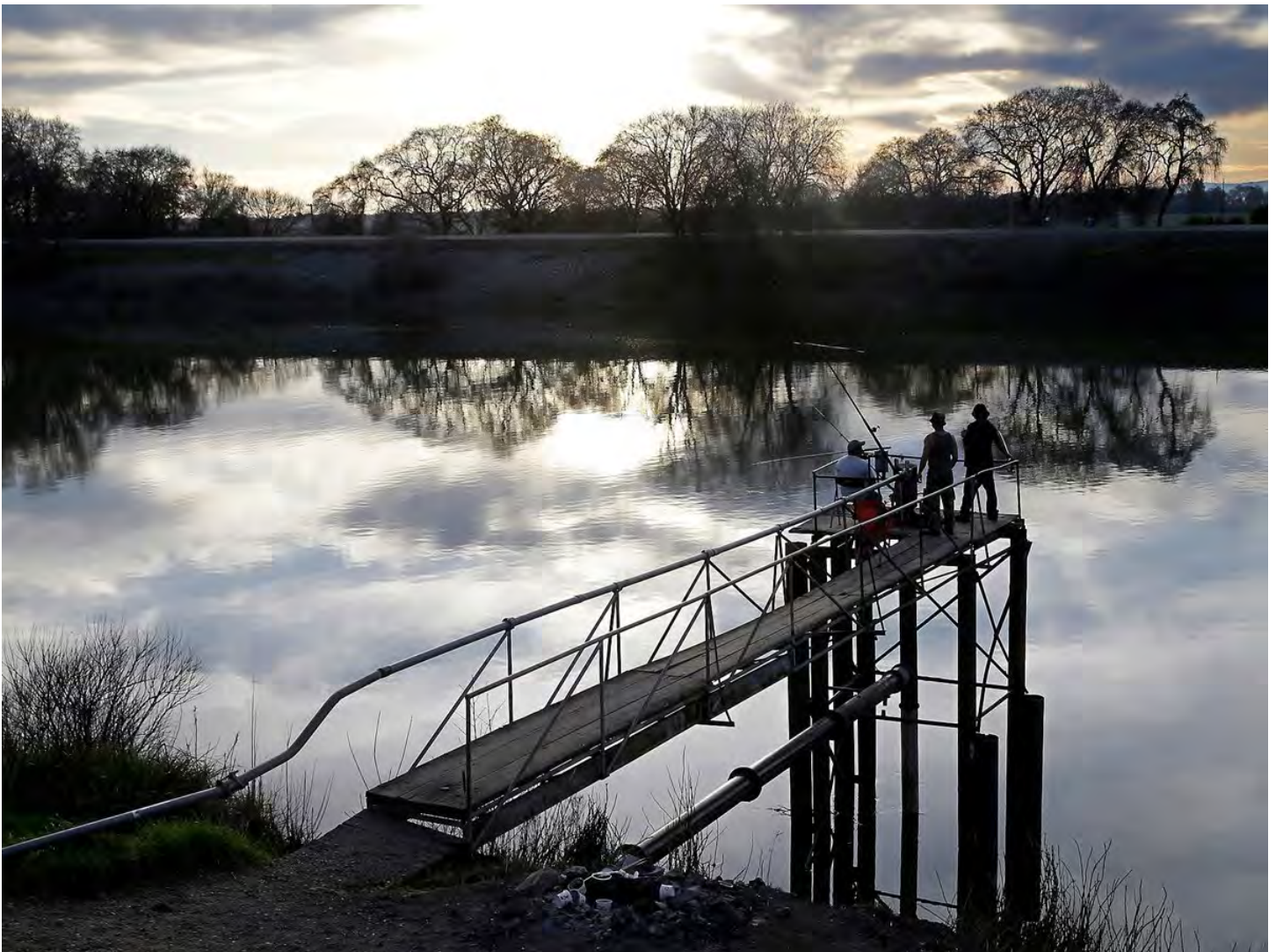
In this Feb. 23, 2016 file photo, people try to catch fish along the Sacramento River in the San Joaquin-Sacramento River Delta, near Courtland, Calif.